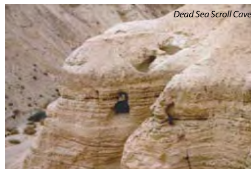
Dead Sea Scroll Cave

Costs: The tour cost is per person based on current airfare from New York/JFK (other cities available), double occupancy, tariffs and currency valuations as of August 2008, a minimum of 30 travelers, and subject to confirmation. While we will do everything possible to maintain the listed price and/or itinerary, they are subject to change due to circumstances beyond our control. Single room supplements may have limited availability and are on a request basis only.