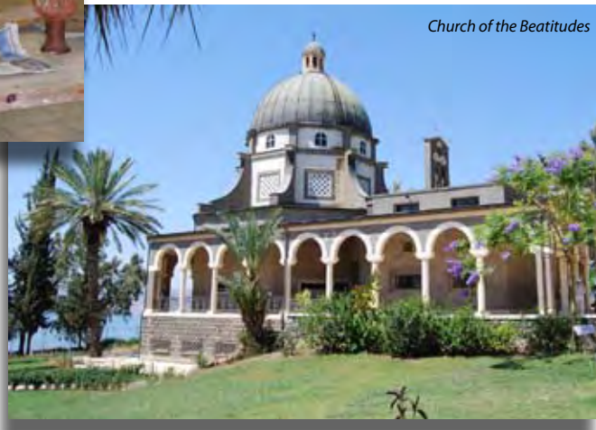
Church of the Beatitudes