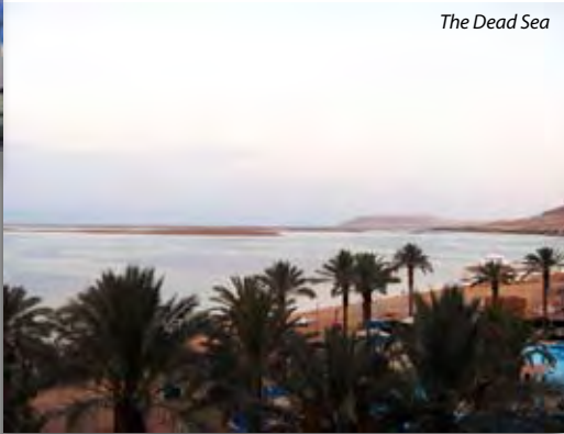
The Dead Sea